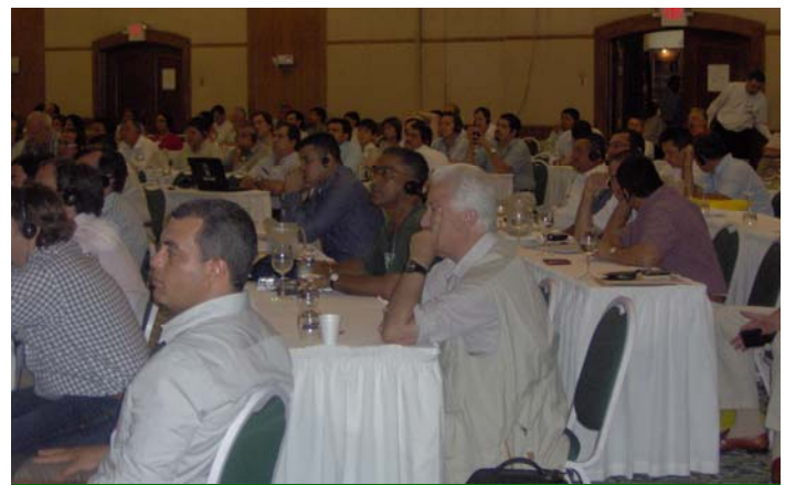
A large crowd listens to a panel addressing South American rice trade issues.