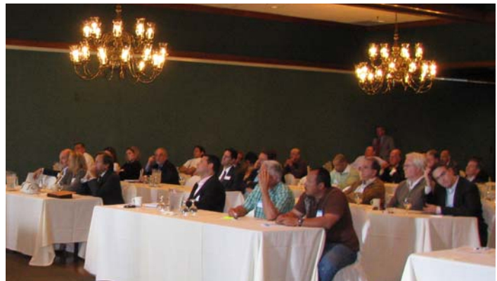
Attendees at Texas-Cuba Trade Alliance's Export to Cuba Workshop at Brady's Landing in Houston, TX

An informative and well presented overview of the historical and current situation in Cuba started the workshop, giving attendees a good historical background of how we have gotten to where we are today. The following presentations focused on the Cuban market potential, export licensing as well as information pertinent to doing business in Cuba. All the presenters were very thor-