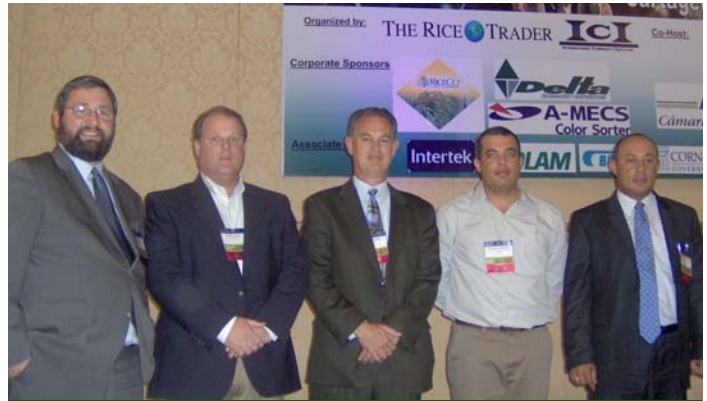
A panel that addressed seed and varietal developments for the future, genetically modified rice and the cost of food security from a seed industry's viewpoint drew great interest and a long Q&A session.

A full report on the conference will be included in next week's Rice Advocate.