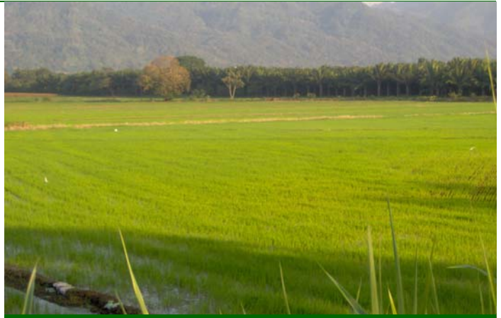
Despite the absence of a government supported quality seed program, national rice production in Honduras is expected to reach one million hundredweights this year. This field near the city of El Progreso belongs to BAPROSA (Beneficio de Arroz Progreso, S.A.)