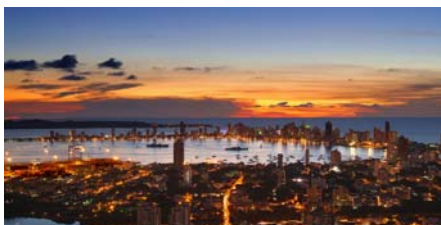
Cartagena, Columbia

so many different countries. We expect this conference to grow in the years ahead thanks to the involvement of so many key players from around the Americas. Our development of a highly recognized steering committee from throughout the region will enhance the program in the years