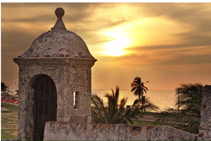
Cartagena, Columbia